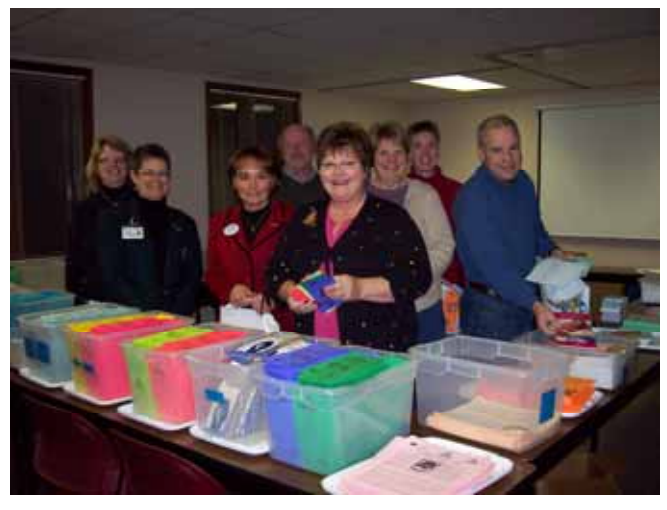
Safe Kids Stars: Some of the Grand Forks Sunriser Kiwanis

total of 1021 car seats being checked or installed!! Misuse in 2007 was 67%. This number is lower than the national average of 80-90%, however there is still a lot of misuse in our community. Thank you to all the car seat technicians who assisted last year and to all the area businesses who donated space and time!